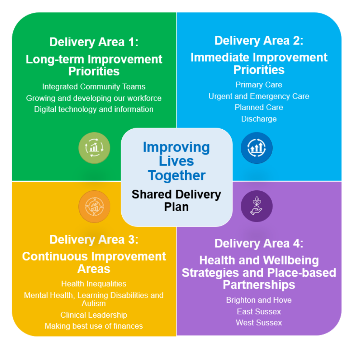
Figure 1: Overview of our Shared Delivery Plan

Improving Lives Together is built on the Health and Wellbeing Strategies across our three 'places' of Brighton and Hove, East Sussex, and West Sussex. These set out the local priority areas of work taking place to best meet the needs of our diverse populations. Health and care organisations are working together to deliver these strategies, as well as the long-term, immediate, and continuous improvements that need to be made to achieve our ambition.